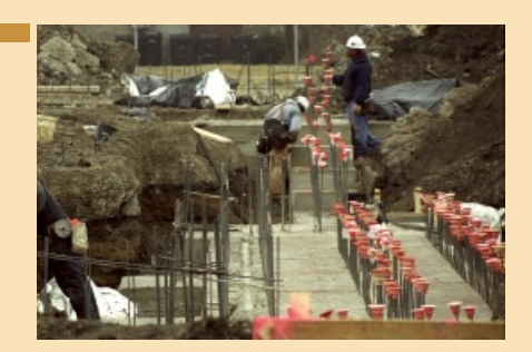
The new Simeon will include both regular and vocational classrooms, computer equipment and specialized art and music rooms. All of the new building will be accessible to people with disabilities.

"The new Simeon High School will benefit more than 1,600 youngsters, as well as revitalize the surrounding community," said Chicago Public Schools chief executive officer Arne Duncan. "Our capital needs are great, but we are constantly looking to upgrade our education infrastructure by building new schools and improving existing buildings."