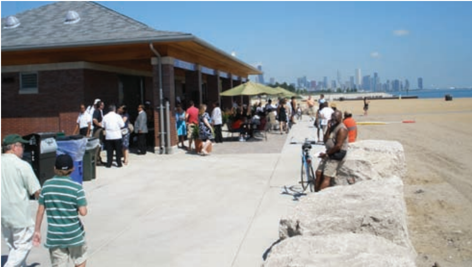
Figure 1 The beach houses at 41st Street Beach and Osterman Beach are situated on Chicago's North and South sides. The project team successfully sought a variance to the Chicago Code to bring rainwater harvesting technology to the city's lakeshore.

On warm summer days in Chicago, locals and tourists can be spotted playing with water. Children splash in spray pools that decorate the city's neighborhoods, while families in Millennium Park wait for the faces of Crown Fountain to spill water over the crowd. Travel a little south to Grant Park, and the historic Buckingham Fountain is using water to create a sky-high spectacle.