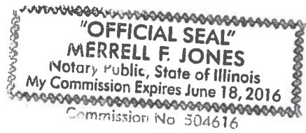
Notary Public My Commission expires: 6/18/2016

Subscribed and sworn to before me this 14th day of January, 2016 .