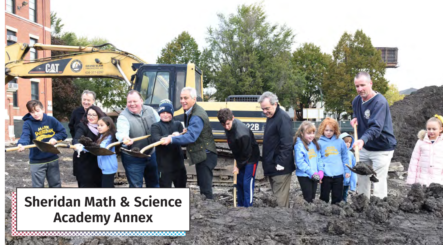
Sheridan Math & Science Academy Annex