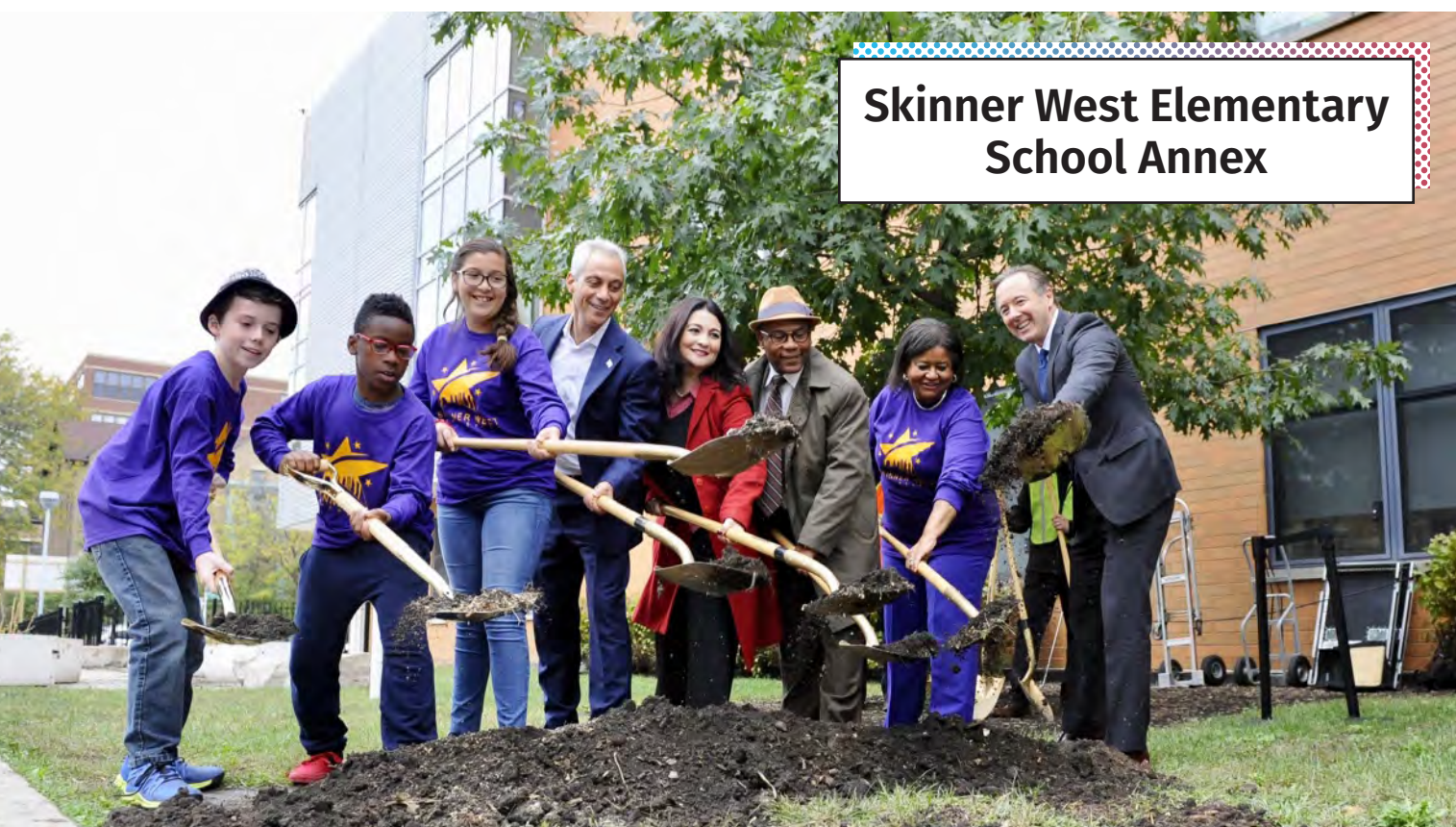
Skinner West Elementary School Annex