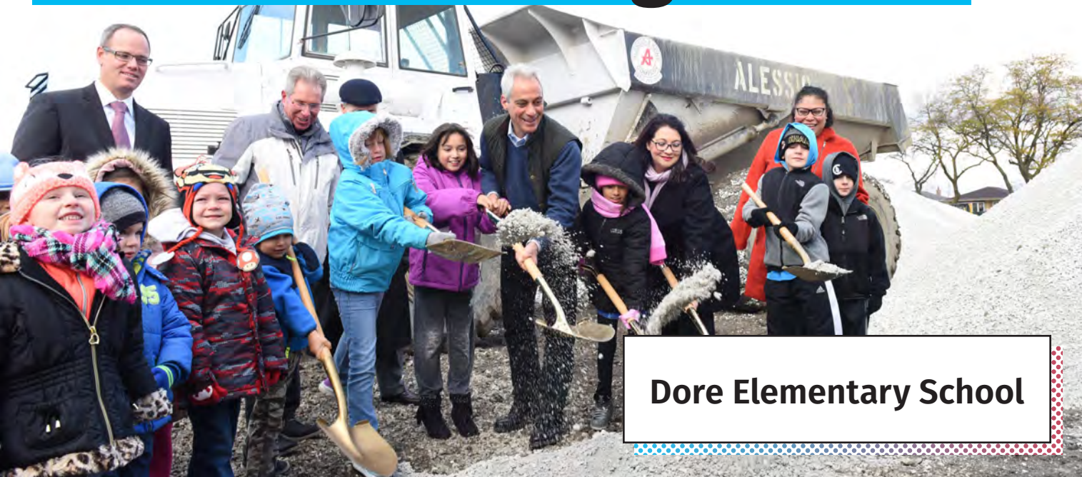
Dore Elementary School