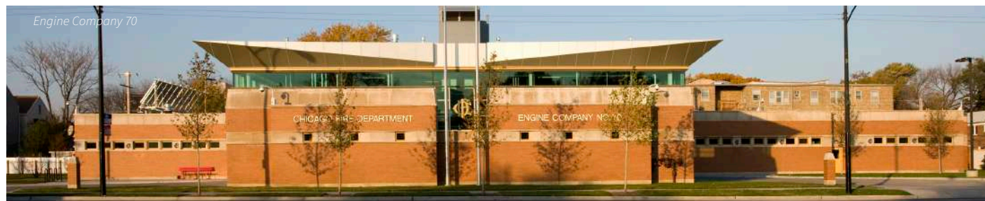
Engine Company 70