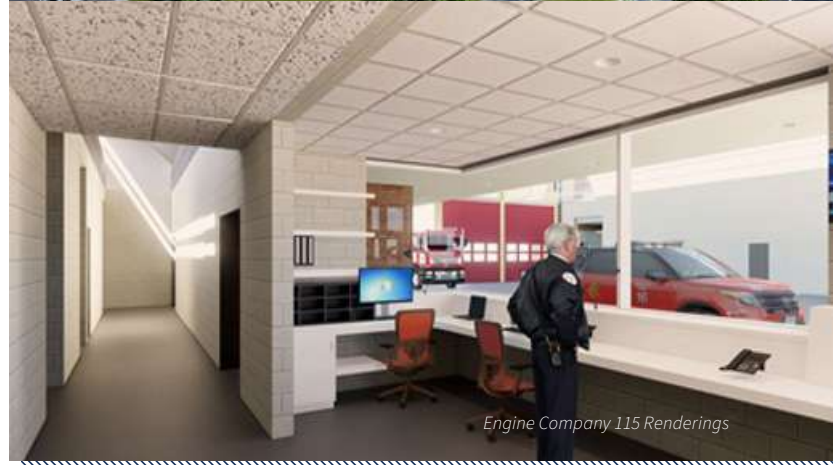
Engine Company 115 Renderings