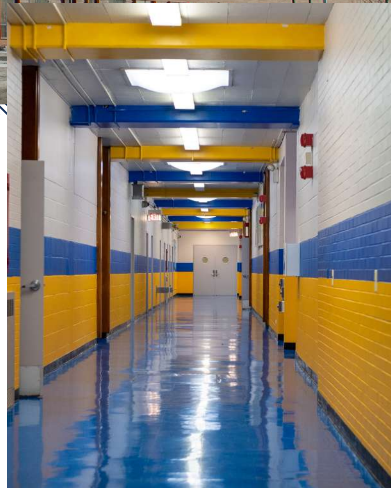
Dore Pre K

Another anticipated new school located in the Dunning community, Taft Freshman Academy has a three-story academic wing and a one-story athletic wing connected by a high ceiling, single story link. The school has classrooms and labs for science, computer learning as well as performing and visual arts.