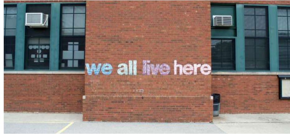
John M. Palmer Elementary

My first love is playing music but later I fell in love with architecture and thought it would be a great career choice. My love for music fuels my love for architecture and the two together I feel makes me a better architect,