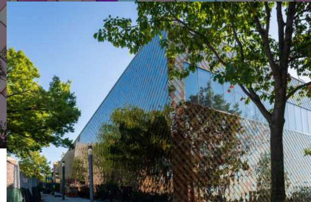
Williams Park Community Center