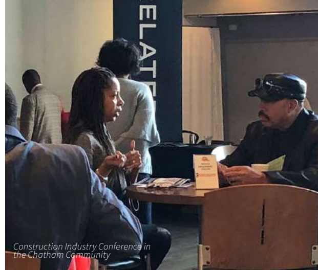
Construction Industry Conference in the Chatham Community

To that end, the PBC assist our general contractors in hosting community hiring events. These community hiring events are an essential part of our work and help our contractors fulfill their community area hiring requirements. We had great turn outs for our recent events (pictures)