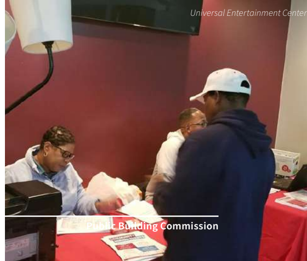
Universal Entertainment Center