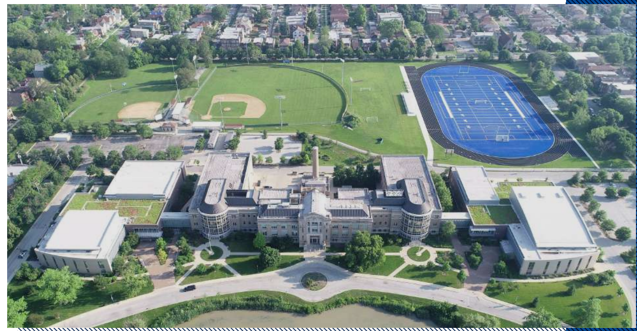
Gwendolyn Brooks CP Academy