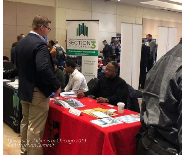
University of Illinois at Chicago 2019 Construction Summit