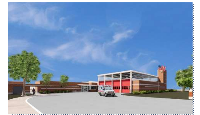
Engine Company 115 Renderings

Anticipated to be open by summer 2020, the new fire station will be built on vacant land located at 119th Street and Morgan Street, replacing the existing Engine Company 115 located at 11940 South Peoria Street.