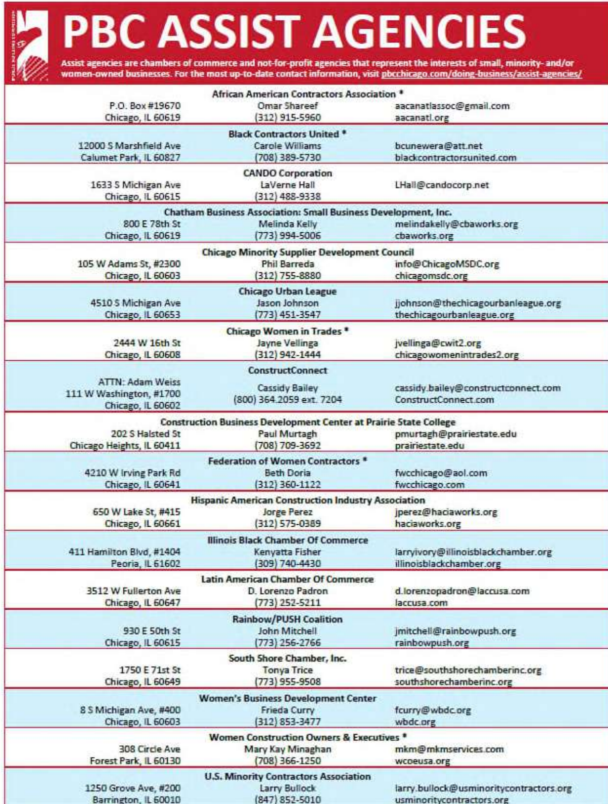
EXHIBIT #4 ASSIST AGENCIES