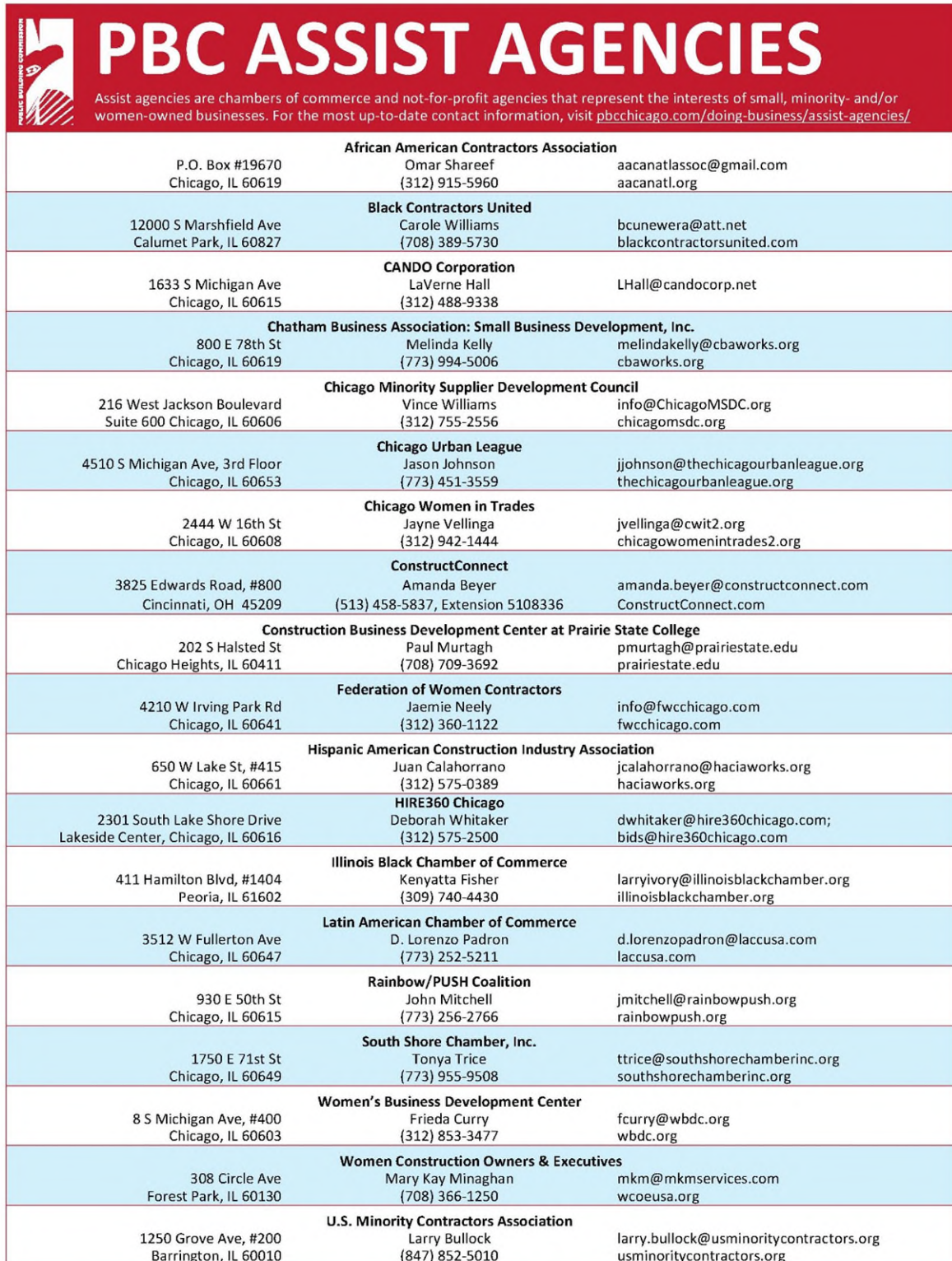
EXHIBIT #4 ASSIST AGENCIES