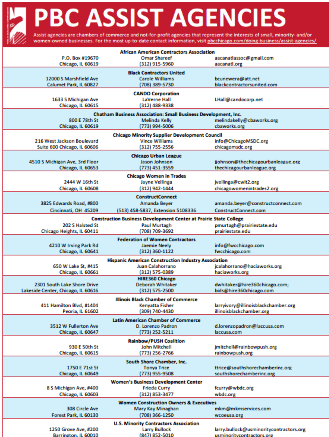
EXHIBIT #4 ASSIST AGENCIES