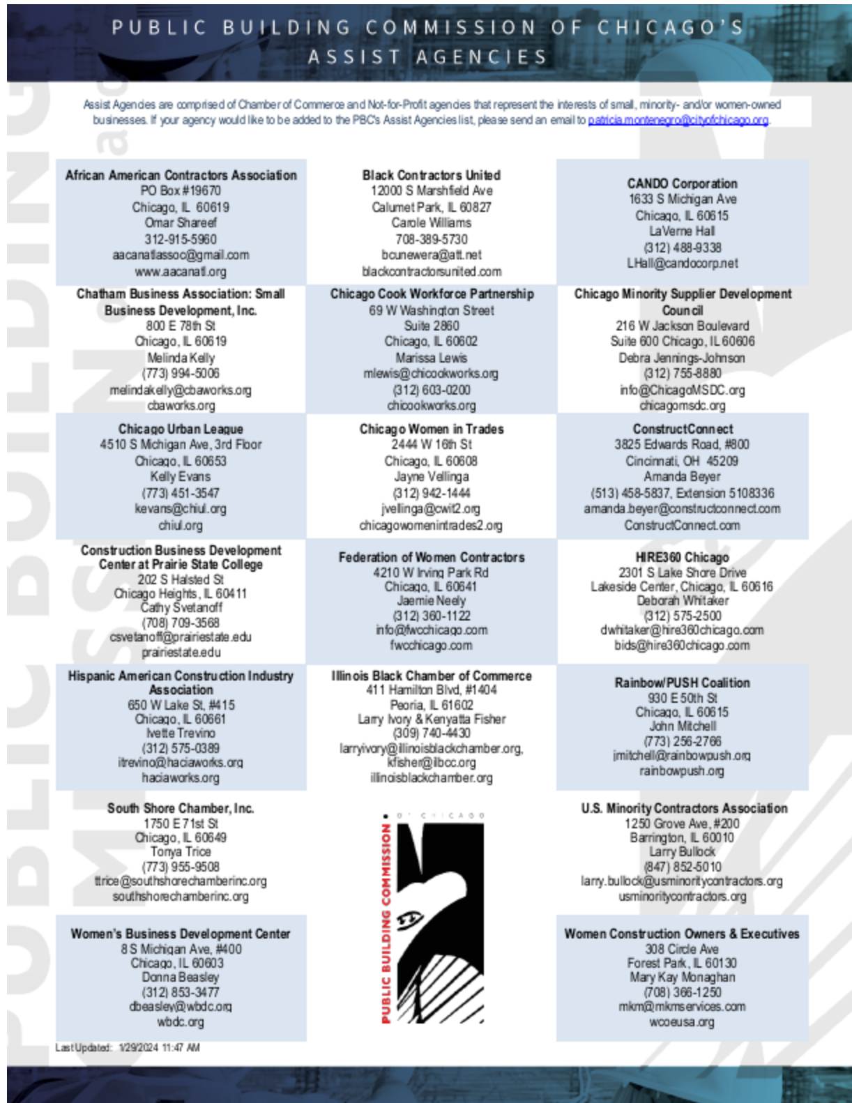
EXHIBIT #4 ASSIST AGENCIES