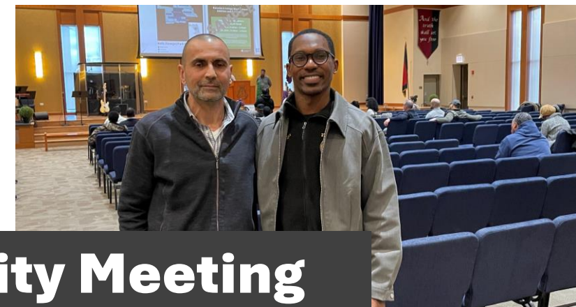
Kells (George) Park Fieldhouse Community Meeting