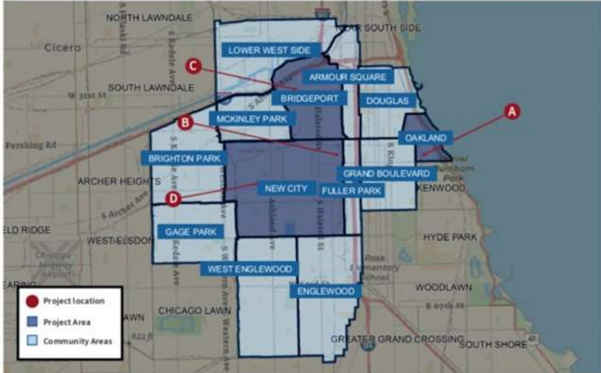
EXHIBIT #3 PROJECT COMMUNITY AREA MAP